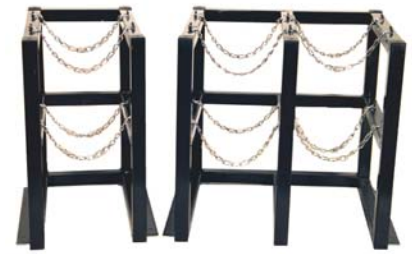
STD 1x2 STD 2x2 Standard Cylinder Barricade Racks

Structural Tube Design racks are recommended for indoor or outdoor bulk cylinder storage. STD series racks surround cylinders with 2 inch square steel tube continuously seam welded and sealed with exterior grade powder paint. Two levels of welded steel chains with snaps for each cylinder. Standard and custom configurations from one to 16 or more cylinder capacity, up to 12 inch diameter standard or 33 inch cryogenic cylinders. Units meet or exceed UFC, NFPA, CGA, and OSHA, as well as Seismic Zone 4 requirements. Optional process rail models add 2 controls mounting struts. Firewall barriers are rated 1 hour fire resistance by encasing Marinite I™ barrier material in 14 gauge steel panels. Fire barriers can be installed freestanding or attach to racks. Ships motor freight.