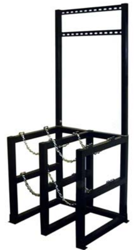
STD 2x2P Process Station Racks