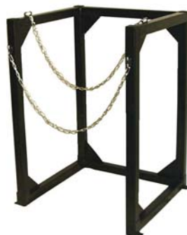
STD-CRYO1 Cryogenic Cylinder Racks